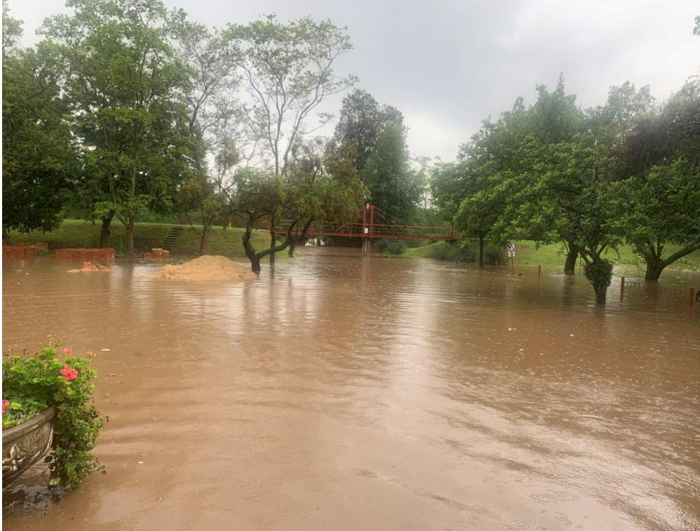
Surprisingly much less litter than normal floods