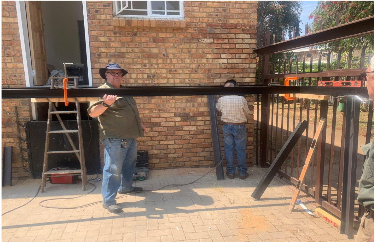
Men at work on the raised (above Centurion sea level) entrance area to the flat