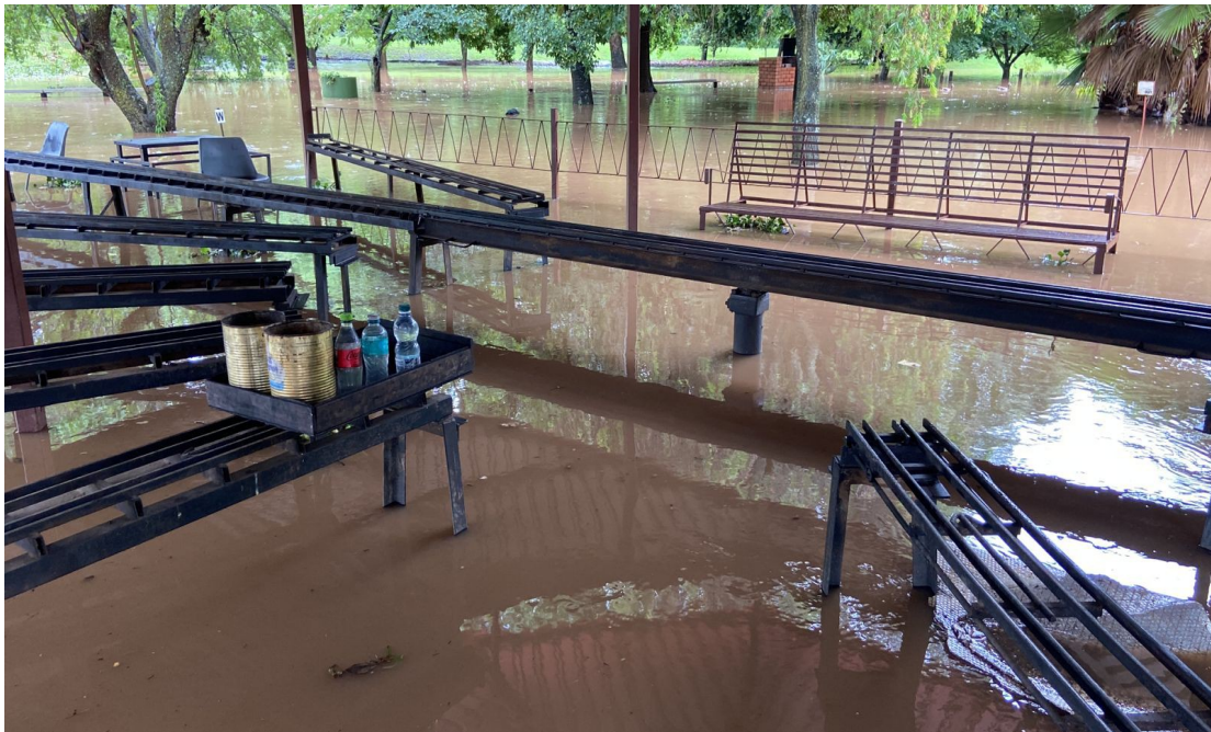
The steam bay in “clean” flood waters