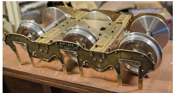
Carel Janse van Rensburg's parts for a EW tender bogie in Cape Gauge 1, 1:24 scale. These tenders were used on the SAR class 23 steam engines, and later on the 15F engines, for which these are destined.