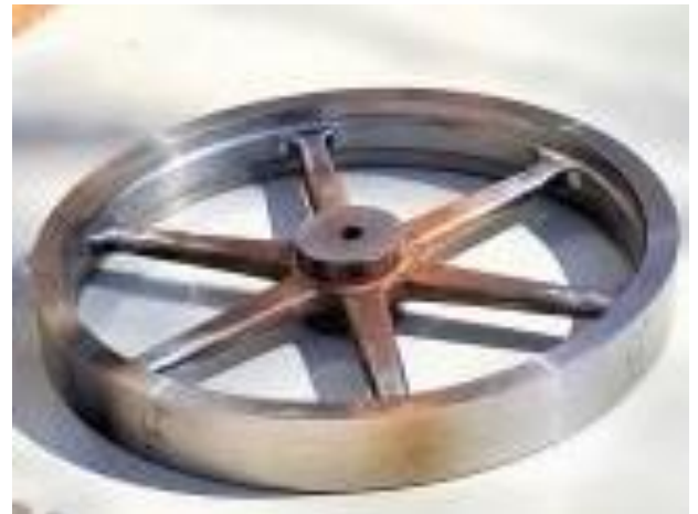
Eddy Lloyds flywheel for portable engine