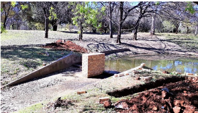
Raised track bridge pillar