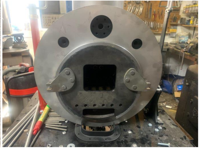
Firebox view of Bagnall "Teresa"