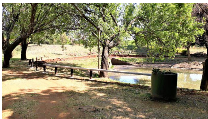
raised track progress