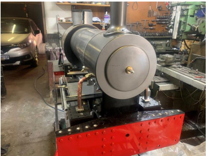
Front end views of Bagnall "Teresa"