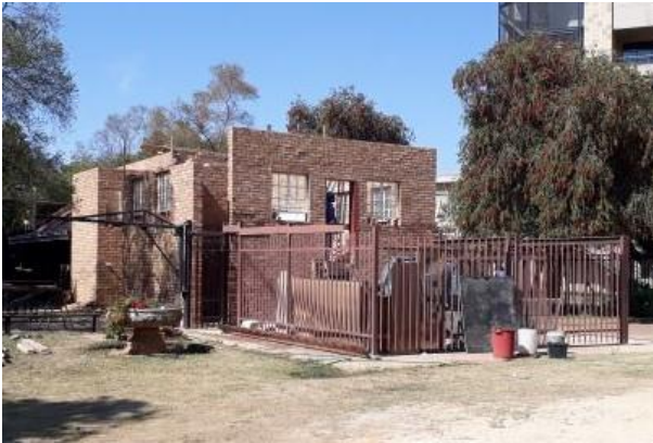
Progress on the flat

Tree trimming and clearing around the keiapple bushes and planting of new keiapples and trees have dropped on the priority list, and will only resume when major works are completed.