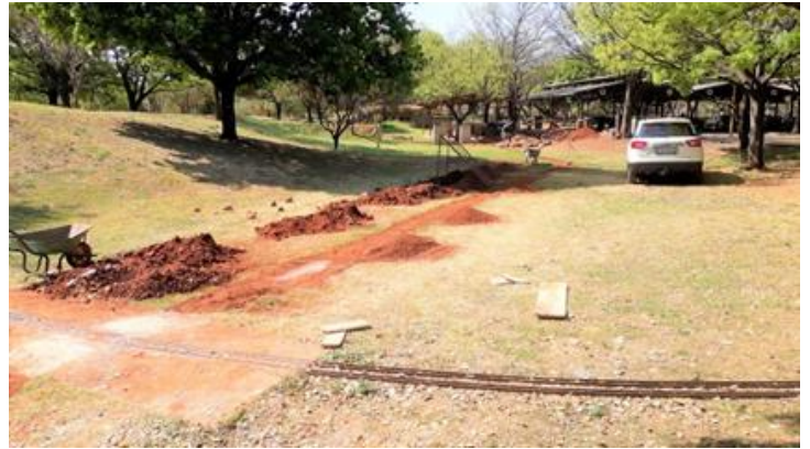
drain laying from G scale area