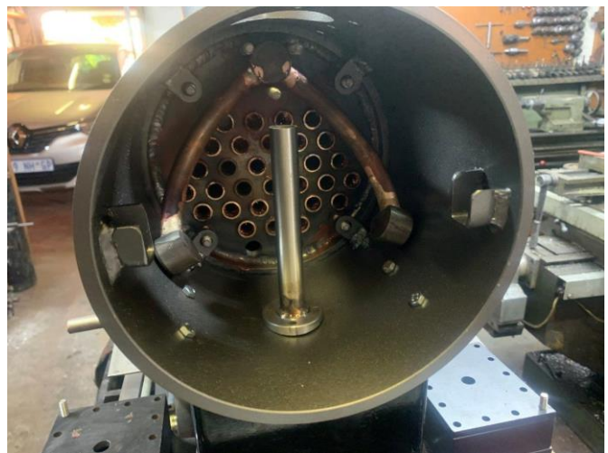
Leon is a fast worker also neat and accurate!