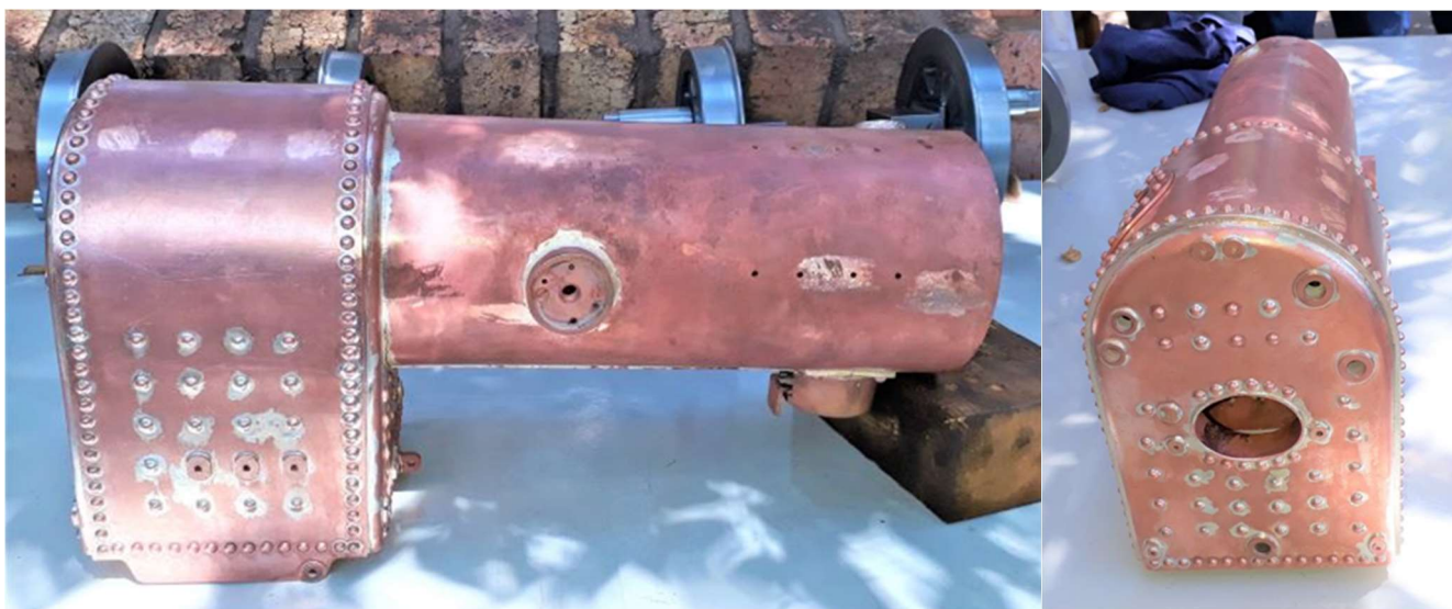
Eddie Lloyd's portable steam engine boiler after nice clean silver soldering!