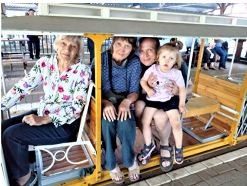
Four generations of a visiting family on Sunday 20 th March