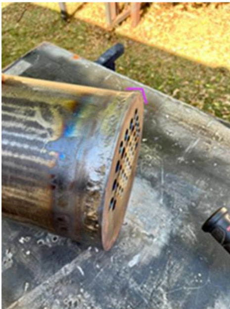
Tube plate welded nicely