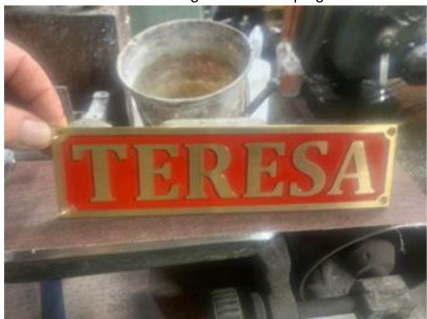
nameplate for lizzie's sister loco