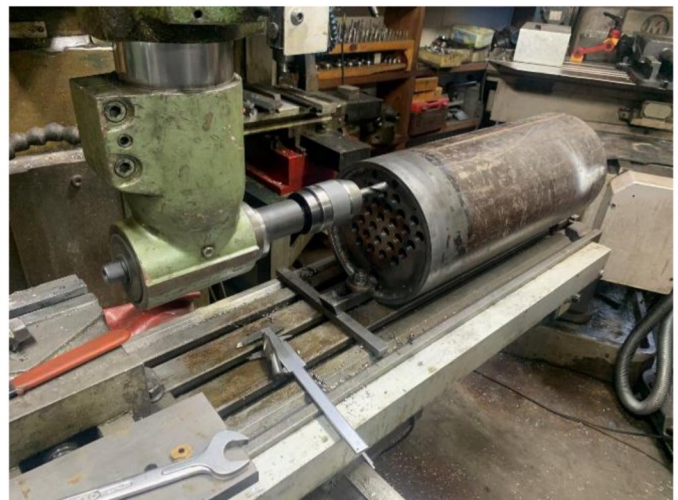
drilling for washout plugs