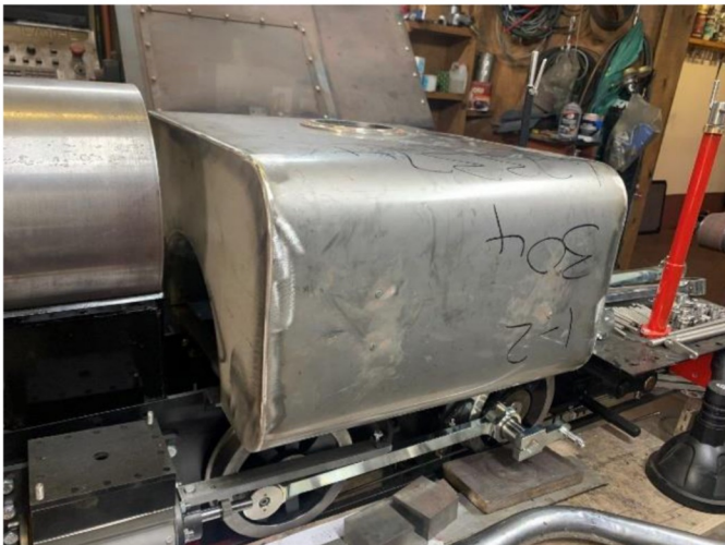
stainless steel water tank for Teresa