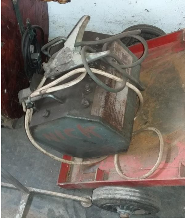
Welder only not including trolley