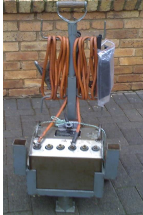
Welder with trolley and accessories