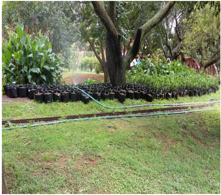
Kei- apple plants to be planted out when large enough.